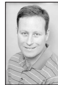
By Brett Gottlieb, D.C.

S o you think you've tried it all—heating pads, over-the-counter pain relievers, prescription pain medications, muscle relaxants, deep tissue massage, physical therapy, and acupuncture.